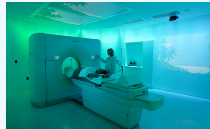
Ambient lighting MRI / CT room

In addition to its calming atmosphere, Thompson Peak Hospital offers an array of services including: emergency department and accredited Chest Pain Center; intensive care unit; surgical services; and a full complement of outpatient services - radiology (X-ray) and laboratory services. Diagnostic services include Arizona’s only MRI and CT