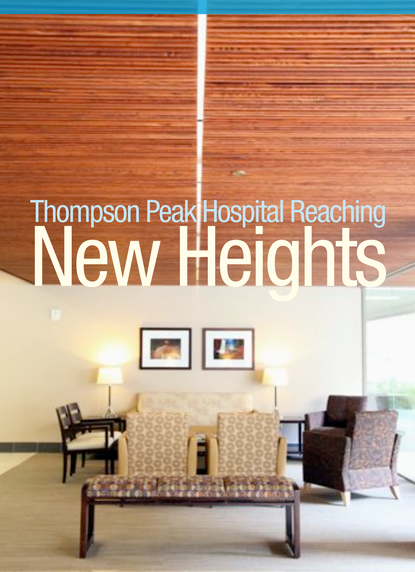
Thompson Peak Hospital Healing Garden Lobby

Being the “new kid” on the block can be challenging. Thompson Peak Hospital, the newest addition to Scottsdale Healthcare’s network of world-class facilities, has more than met the challenge and in fact, has flourished since opening just three years ago.